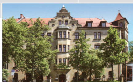
Bildungsberatung International im Internationalen Beratungszentrum (IBZ) Goethestraße 53